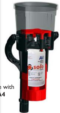
For use with Solo A4

Solo 332 Aerosol Dispenser for larger diameter detectors.