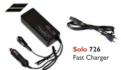
Solo 726 Fast Charger